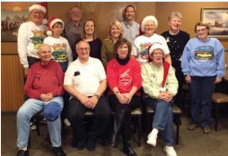
Top row: The Classy Chassy Walk Teams 2006–2013.