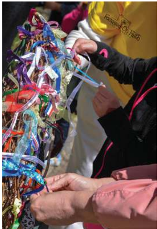
Tying ribbons in memory of loved ones on the Walk for Dignity Wreath of Remembrance