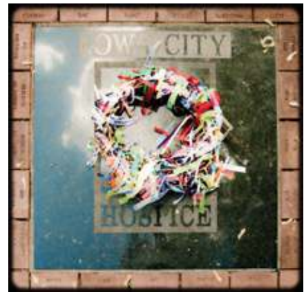
Wreath of Remembrance on the center stone at Iowa City Hospice's Volunteer Trail Site meditation garden.