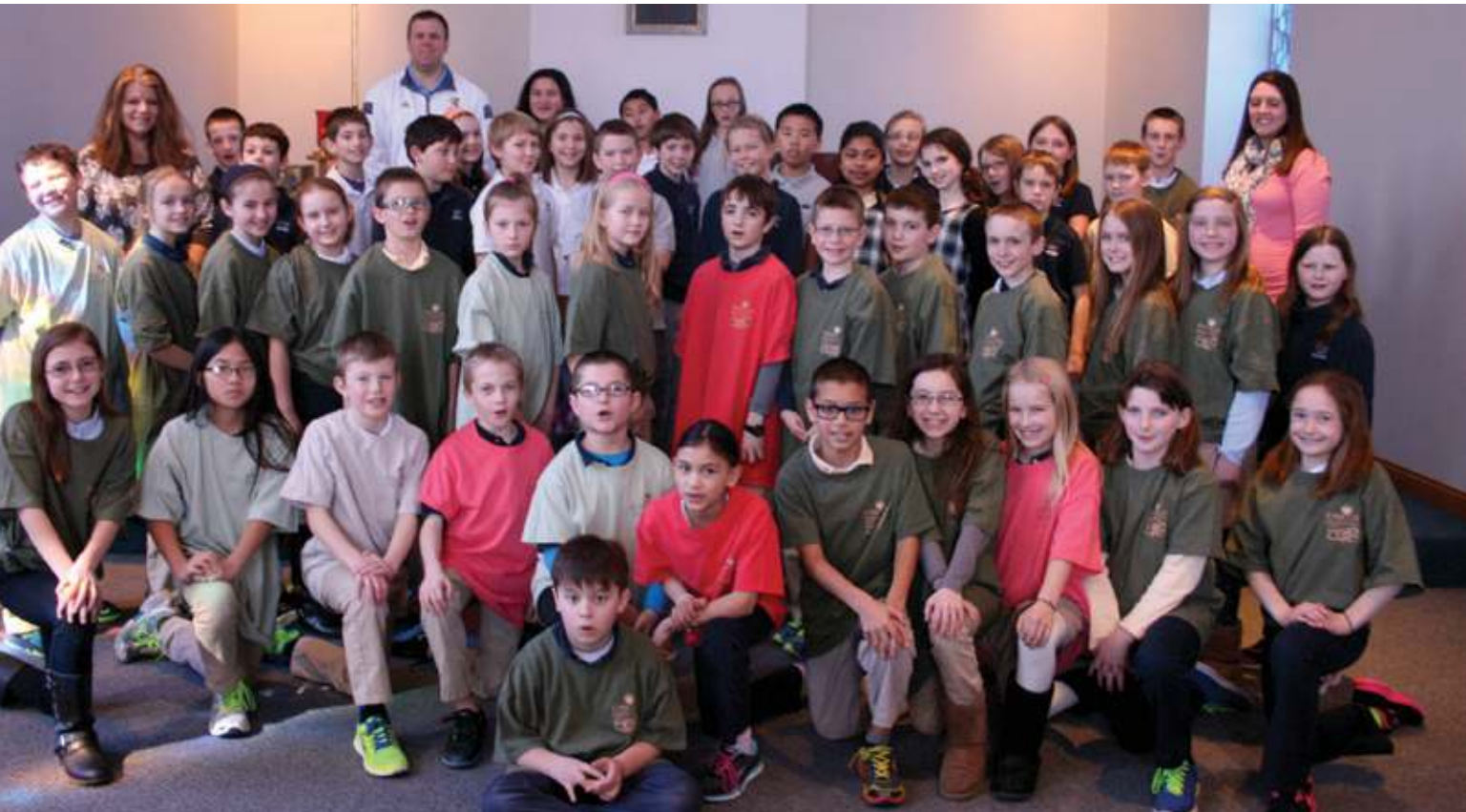
Regina Elementary School's 2015 Fabulous Fourth Grade Class

2014 IOWA CITY HOSPICE ANNUAL REPORT AND HONOR ROLL OF DONORS