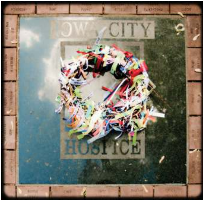
Wreath of Remembrance on the center stone at Iowa City Hospice's Volunteer Trail Site meditation garden.